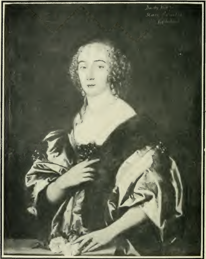
DOROTHY, COUNTESS OF SUNDERLAND.